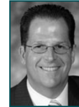
Senator Brian P. Stack (Invited)