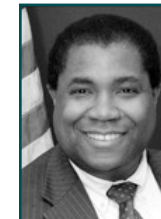
Assemblyman Herb Conaway