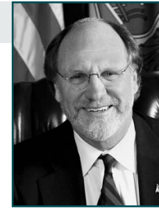
Governor Jon S. Corzine (Invited)