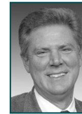
Congressman Frank Pallone, Jr. (Invited)