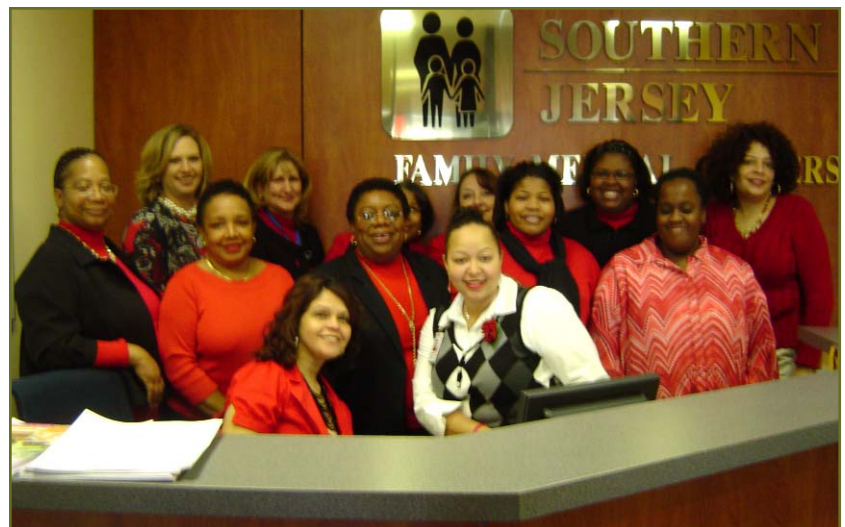
SJFMC Corporate Office Staff wearing their red colors!

On Friday, February 6, 2009, Southern Jersey Family Medical Centers in Hammonton gave support for a nationwide movement that supports the efforts of women in their fight against heart disease. National Wear Red Day brings a focus on the prevalence of heart disease among women, which has become the leading cause of death among women today. While many women may still be unaware that heart disease is such a potential risk, this initiative is designed to educate all women about the facts, risks and ways to lead a potentially healthy lifestyle. Shades of red were visible throughout the center as employees joined together to show support for the on-going efforts to educate and improve women's heart health.