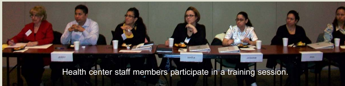
Health center staff members participate in a training session.