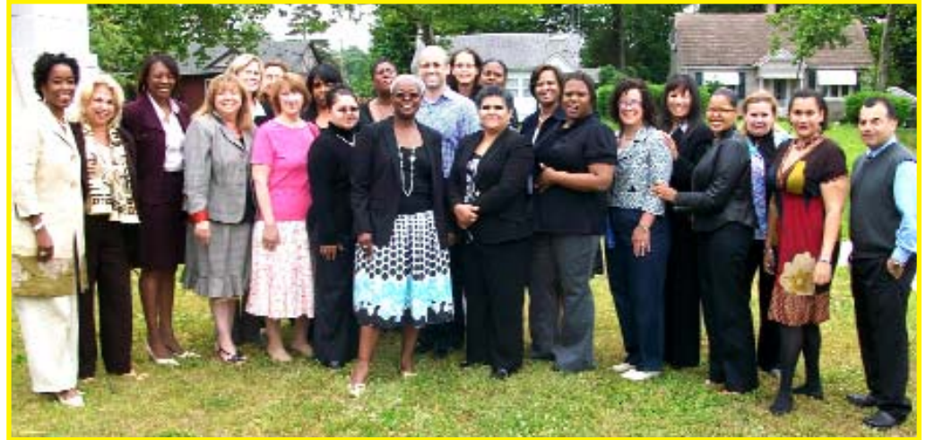
National Health Center Week Coordinators

New Jersey Primary Care Association “kicked-off” National Health Center Week (NHCW) with a planning meeting that was held in the community room of the Neighborhood Health Center Plainfield on Thursday, May 28, 2009. Close to 30 people representing health centers, Medicaid managed care organizations, and pharmaceutical companies attended this meeting. All will contribute to the success of National Health Center Week in some way, shape or form.