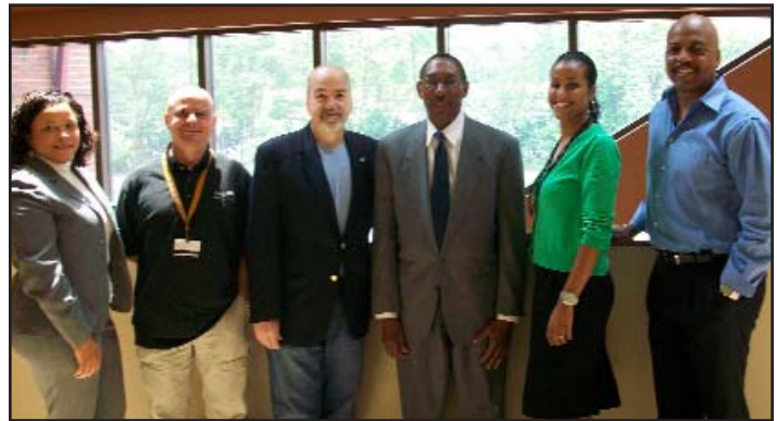
Health Center Facility Managers

The Health Center Event Coordinators Network was formed to promote the coordination and sharing of information on health center events both at the local and state levels. The first meeting was held on April 27 and was attended by 15 health event coordinators representing 12 health centers. An important part of the discussion was the potential for shared events locally and regionally.