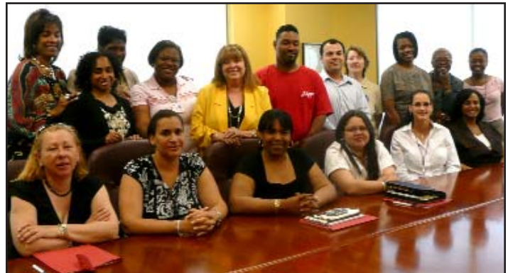
Health Center Event Coordinators