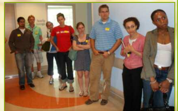
SEARCH summer students touring the Children's Specialized Hospital in New Brunswick, NJ

Currently, the students are focusing on their individual projects, posters and reflection papers. Overall, students have been provided with valuable information that will help them not only with their summer experience, but will also help with their future careers. The summer program will end on July 18th with a closing ceremony and appreciation dinner attended by both students and representatives from host sites.