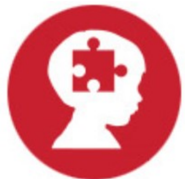
Pediatric Developmental & Behavioral Health ECHO Clinic

Attend a minimum of 12 out of 48 sessions over a year.