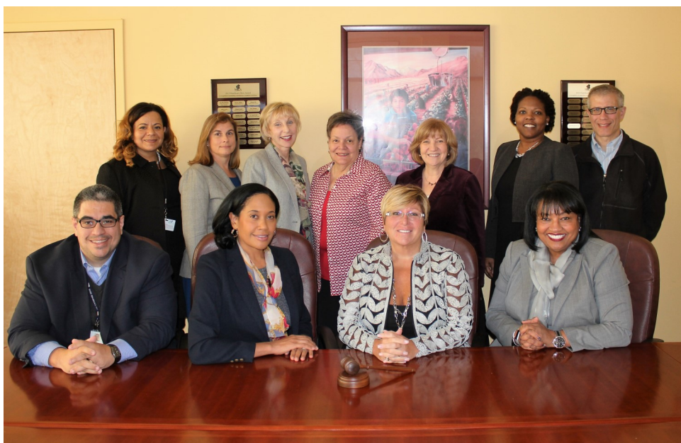
A few NJPCA colleagues after a November meeting.