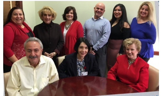
The North Hudson team.

The North Hudson Community Action Corporation Health Center in West New York has been named a 2017 Hypertension Control Champion. This honor was given by Million Hearts and the Centers for Disease Control and Prevention. North Hudson was able to achieve blood pressure control rates at or above 70 percent in their health care practices and systems. Congratulations on a job well done!