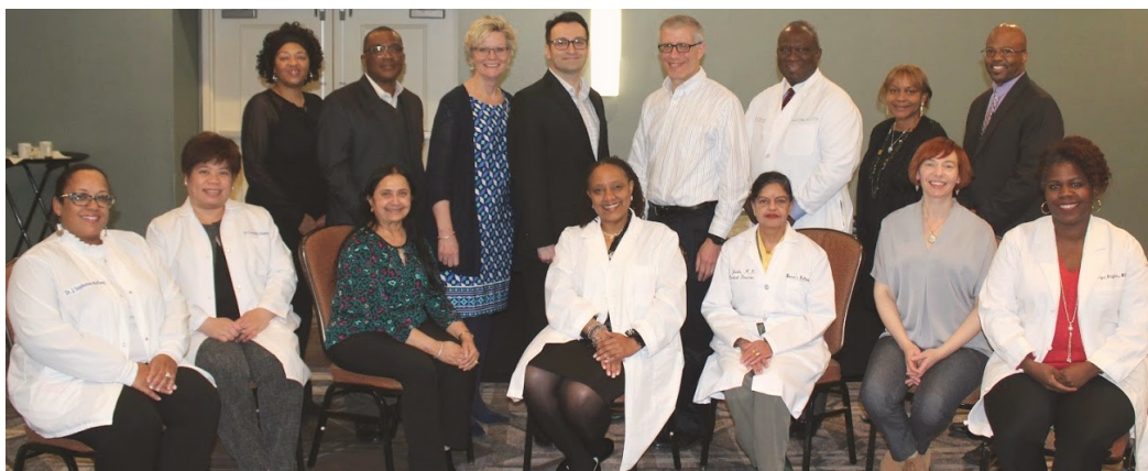
Medical and Dental Directors of New Jersey Community Health Centers

The 2018 Annual Clinical Quality Forum was held on April 20th. 71 participants from 16 Federally Qualified Health Centers attended the event. Additional Community Health partners in attendance included: U.S. Department of Health and Human Services, HRSA Office of Regional Operations - Region II; New Jersey Department of Health; and Aetna Better Health of NJ.