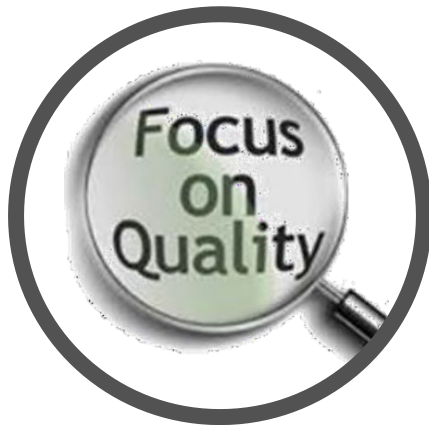
Clinical Quality Forum March 2026

Individual event sponsorships and bundled sponsorships are available.