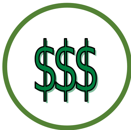
Financial Roundtable Summit June 2026