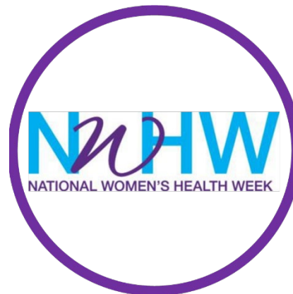
Women's Health Luncheon May 2026