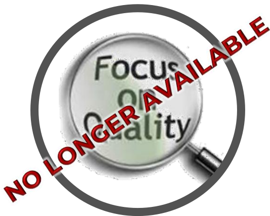
Clinical Quality Forum March 2026

Individual event sponsorships and bundled sponsorships are available.