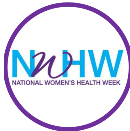
Women's Health Luncheon May 2026