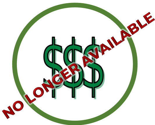
Financial Roundtable Summit June 2026