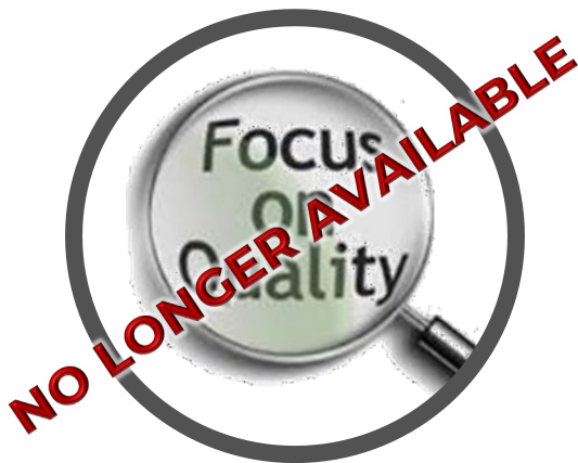
Clinical Quality Forum March 2026

Individual event sponsorships and bundled sponsorships are available.