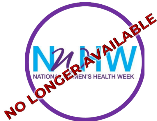
Women's Health Luncheon May 2026